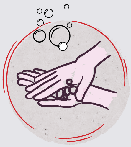
Rub hands palm to palm