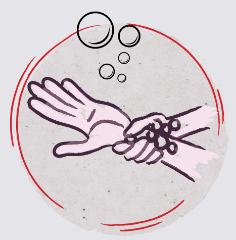
Focus on your wrists