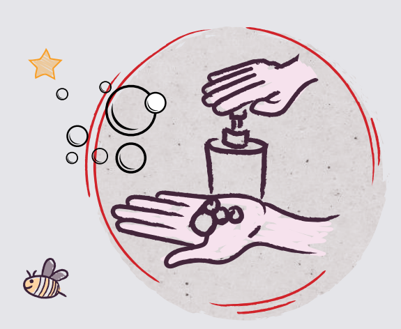
Wash hands with warm water and soap