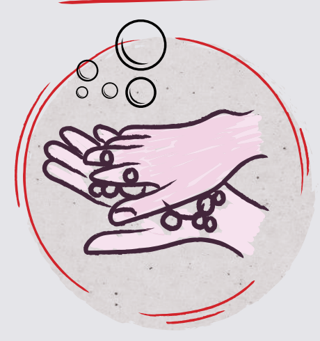
Rub between fingers