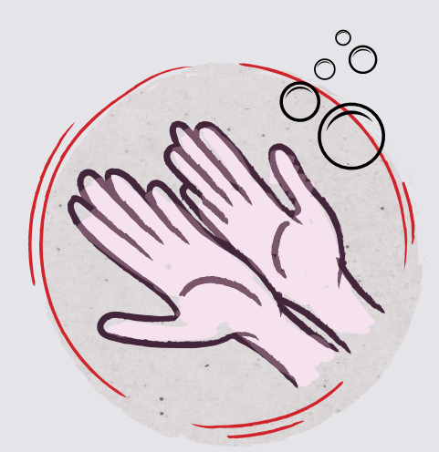
Rinse hands with warm water